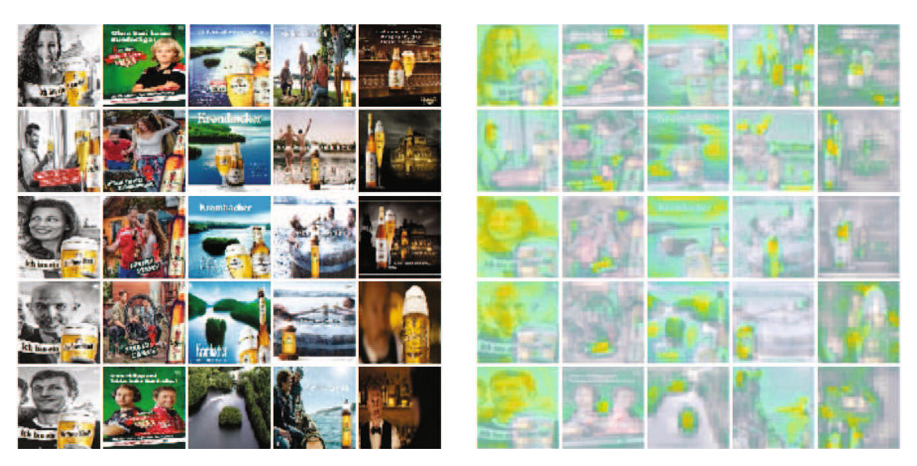
Fig. 3 The first five images (ads) for five brands (column by column) in 64x64 resolution on the left and—in the same order—with superimposed class activation map heatmap according to Grad-CAM on the right. White areas have highest activation followed by yellow and green areas

advertised brands. Table 1 shows the resulting confusion matrix. Here, the diagonal values reflects the percentage of "correct" predictions by the CNN which—as we already now—is 90.8% across all ads. Especially high (99 or 100%) is this percentage for brands like "Berliner Pilsner", "Hasseröder", "Holsten", "Krombacher", "Licher", and "Veltins", low, e.g., for brands like "Beck's", "Biburger", "Berliner Kindl", and "Warsteiner". A closer look into these ads reflects the problem (as partially discussed above): These brands use ads with high content variations or which have close content relations to ads of other brands. So, e.g., "Berliner Kindl" and "Holsten" use similar layouts (grey colors, large faces, brown glass with beer). However, since "Holsten" is more consistent in this direction (similar content across all ads) its positioning in this direction is stronger and "Berliner Kindl" ads are assumed to advertise for "Holsten". A similar argument holds for "Beck's", a brand that changed its ad content recently and therefore has many variations in the training and test sample. In the next section we will check whether we can find similar results when analyzing video clips.