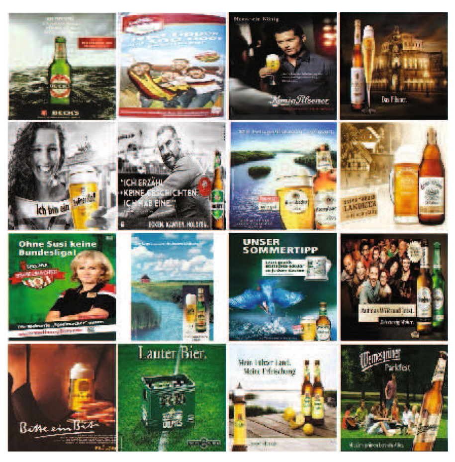
Fig. 1 Sample ads with visual content (not masked) for 16 German Pils beer brands (one image for each brand). The advertised brands are column by column, top to bottom: "Beck's", "Berliner Kindl", "Berliner Pilsner", "Bitburger" (first column), Hasseröder", "Holsten", "Jever", "Karlsberg", "König Pilsener", "Krombacher", "Licher", "Lübzer", "Radeberger", "Veltins", "Warsteiner", "Wernesgrüner" (fourth column)

visual content (photos) could be found for each of the 16 brands that were used in campaigns during the last five years. For most brands about 50 ads with visual contents were available, some brands even had up to 80-90 of them. However, since some ads showed similar content (e.g. when a campaign was used in a consumer magazine and a out-of-home poster campaign), an evenly distributed selection was made with a similar number of ads for all brands, resulting in 817 ads in total (see Fig. 1 with one ad per brand). The number of ads is small but comparable to the scene recognition task by Zhou et al. (2017). Also, it should be mentioned that these numbers are huge compared to the usual number of ads used in a brand confusion experiment (e.g., one ad per brand in Baier and Frost 2018).